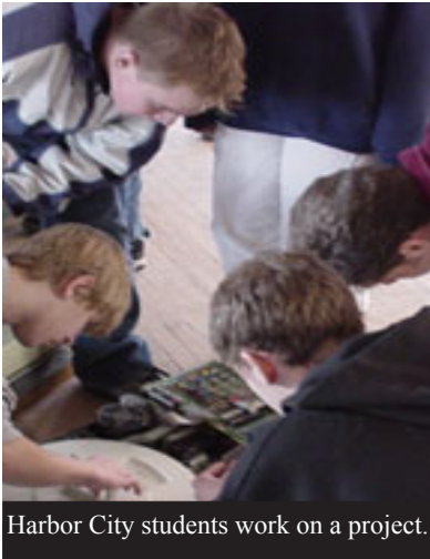
Harbor City students work on a project.

Charter Vision is producing a charter school education magazine insert for the May edition. There will be articles about education philosophy and choices in Minnesota. Every Minnesota charter school will be included. Schools that want to run additional advertisments will be able to do so. It will be a fantastic way to advertise your school. The May edition will be distributed at the Mall of America and the State Fair. You’ll also be able to buy extra copies for your marketing purposes.