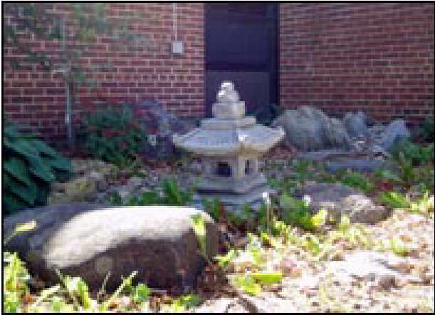
Nerstrand Elementary Peace Garden