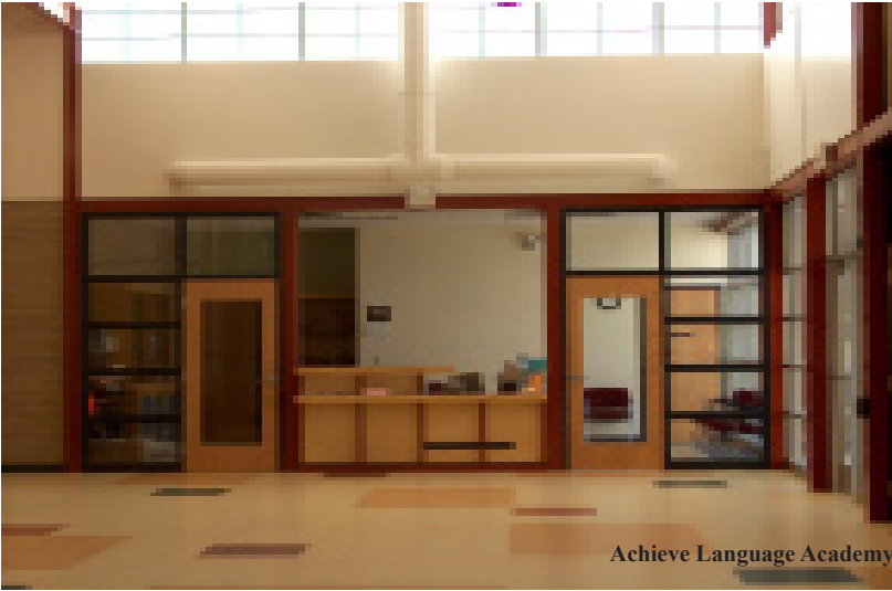
Achieve Language Academy contractor.

The existing classroom building was originally the parochial school and had been extensively renovated. The total cost of $6.65 million includes refinancing the purchase of the building and a smaller expansion built in 2001. The St Paul Housing and Redevelopment Authority issued revenue bonds. Doherty & Company served as the underwriters. The project architect is Hokanson/Lunning/Wende Architects of St Paul. Watson-Forsberg Company of Minneapolis was the general